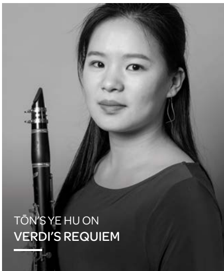
TÓN'SYE HU ON VERDI'S REQUIEM