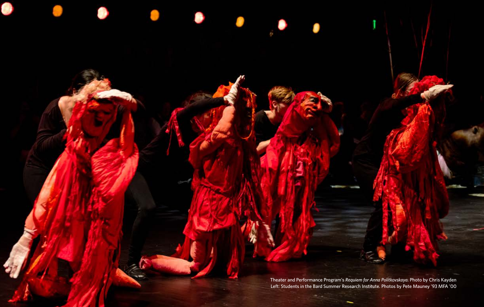
Theater and Performance Program's Requiem for Anna Politkovskaya. Left: Students in the Bard Summer Research Institute.

Students at the conservatory live and attend most classes with non-conservatory students. The requirements for the bachelor of arts degree are the same as for all Bard undergraduates. The conservatory offers unparalleled musical opportunities. Concerto competition winners perform with the American Symphony Orchestra, Conservatory Orchestra, or The Orchestra Now. Conservatory students and faculty have performed together in professional engagements throughout the United States and abroad—including tours of China, Central and Eastern Europe, and Cuba.