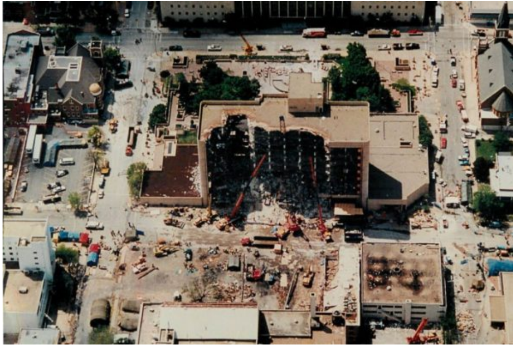
The bombing of the Oklahoma City federal courthouse by White nationalists Timothy McVeigh and Terry Nichols was painted as a conspiracy by the government itself as an excuse to take citizens' guns away.

The meteoric rise of White nationalism within national discourse over the course of Donald Trump's presidential campaign and freshman administration—through Trump's barely coded speech at fascist-style rallies, his support from the internet-based "Alt Right," and his placement of White nationalist popularizers in top positions—has produced a shock of revelation for people across a wide swath of the political spectrum. This shock, in turn, has been a source of frustration within communities of color and leftist circles, where White liberals are often accused of having kept their heads in the sand while more vulnerable populations sounded the alarm about the toll of economic crisis, mass incarceration, police violence, deportation, environmental devastation, and—despite and in reaction to the election of Barack Obama—the unending blare of everyday hate. This is an understandable reaction. It's one I've often shared. But the fact that many of us have long recognized that the country we live in is not the one we are told exists doesn't mean we always understand the one that does. Within social and economic justice movements committed to equality, we have not yet collectively come to terms with the centrality of antisemitism to White nationalist ideology, and until we do we will fail to understand this virulent form of racism rapidly growing in the U.S. today.